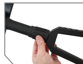
OVERSIZED LOCKING COLLAR