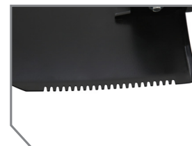
SERRATED EDGE USED FOR CLEARING BRUSH