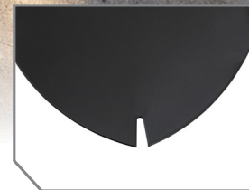
BORON STEEL WITH TWO STEP POWDER COATING

The Overland Vehicle System Utility Shovel is manufactured with a glass filled nylon reinforced handle with locking collar that offers exceptional grip. Our spades are produced with #50 Boron Steel which is stronger and lighter than regular carbon steel shovels. Light weight 7075 aluminum shaft is lighter and stronger and won't corrode. The Serrated Edge is designed for abuse and can be used for sawing or whacking brush. Its compact design provides an Overall Length 22.75-Inch when extended and when Collapsed is 9.25 inch. The business end; the Spade is 6.1-inch x 8.25-inch with Roll Edge On Rear and Side For Added Strength.