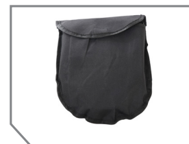
STORAGE BAG INCLUDED